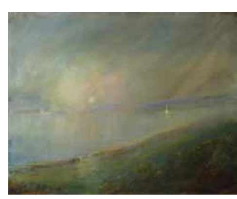
TITLE: Coast MEDIA: Oil on Canvas YEAR: Unknown Nº: Pc001