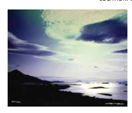
TITLE: Clew Bay MEDIA: Photography YEAR: July 1997 Nº: Pc030