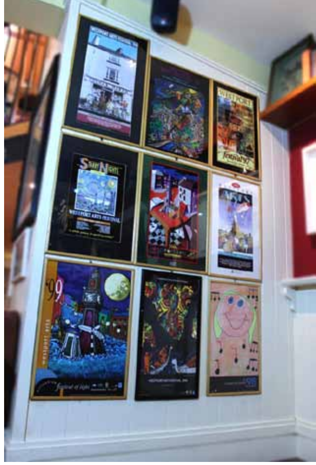
TITLE: Westport Arts Festival Posters MEDIA: Poster YEAR: Through the years №: PR065 LOCATION: JW's Brasserie

We invite you to take a look around JWs Restaurant and Brasserie to discover more of them.