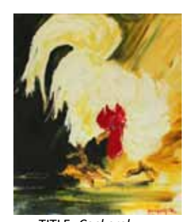
TITLE: Cockerel MEDIA: Oil on Canvas YEAR: Unknown Nº: Pc025 LOCATION: Central Hallway