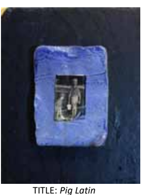
MEDIA: Ceramic YEAR: 1998 №: C069 LOCATION: Jw's Brasserie Bar