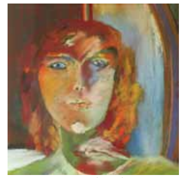
TITLE: Red Head MEDIA: Pastels on Paper YEAR: Unknown Nº: Dp090 LOCATION: JW's Brasserie - Red Room