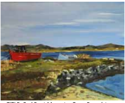
TITLE: Red Boat Monastry Quay Roundstone MEDIA: Oil on canvas YEAR: Unknown Nº: Pc041 LOCATION: The Lane Suite