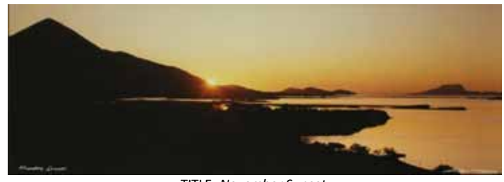
TITLE: November Sunset MEDIA: Photography YEAR: November 1993 Nº: PH029 LOCATION: Central Hallway