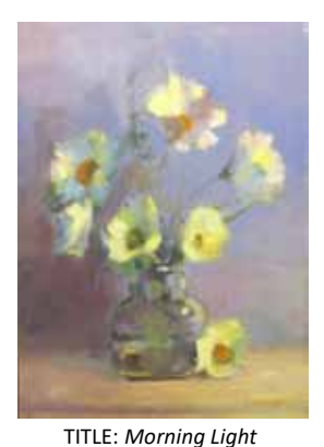
MEDIA: Oil on Canvas YEAR: 1994 Nº: Pc013 LOCATION: Park Terrace Wine Bar