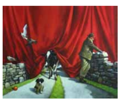
TITLE: All the worlds a stage MEDIA: Print YEAR: Original made in 2004 Nº: PR059 LOCATION: Cobbler's Bar