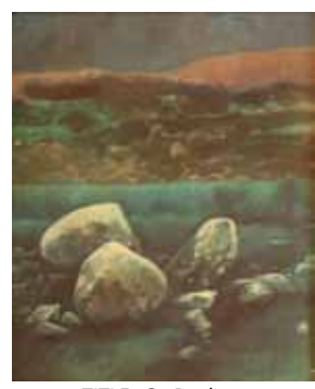
TITLE: Ox Rocks MEDIA: Oil on canvas YEAR: 1989 Nº: Pc089

His work has been exhibited widely and features in public nationally and internationally.