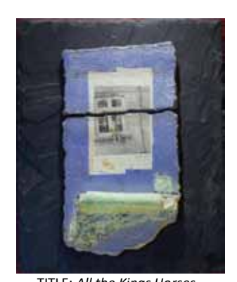
TITLE: All the Kings Horses MEDIA: Ceramic YEAR: 1998 №: C071 LOCATION: JW's Brasserie - Bar