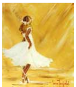
TITLE: Ballet in White MEDIA: Oil on Canvas YEAR: Unknown Nº: Pc003

MEDIA: Oil on Canvas YEAR: Unknown Nº: Pc004