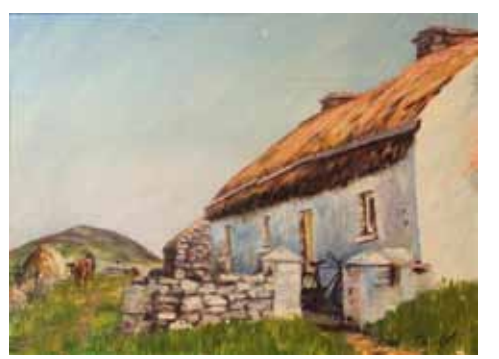
TITLE: Askillaun Louisburgh MEDIA: Oil on canvas YEAR: 1998 Nº: Pc060 LOCATION: Cobbler's Bar