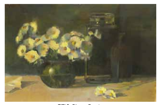
TITLE: Dinner Guests MEDIA: Oil on Canvas YEAR: 1994 Nº: Pc007 LOCATION: Lobby & Reception Area