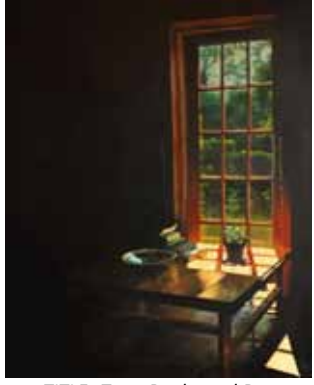
TITLE: Tree. Books and Door MEDIA: Oil on canvas YEAR: 1997 Nº: Pc045 LOCATION: The Lane Suite