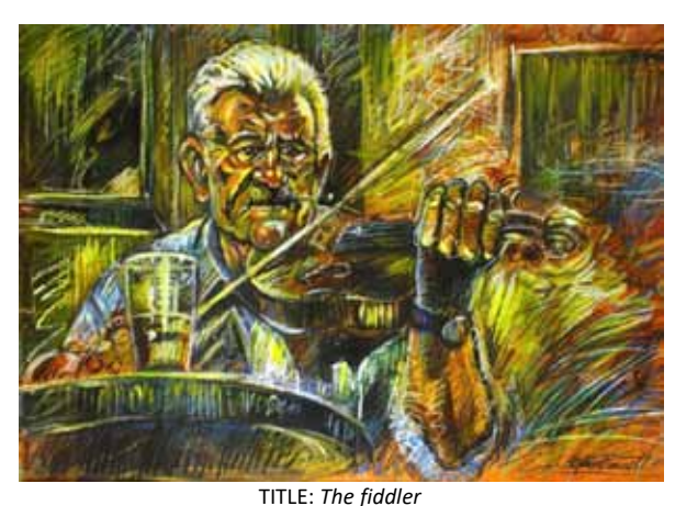
MEDIA: Pastel on Paper YEAR: Unknown Nº: Dp079 LOCATION: JW's Brasserie - Green Room