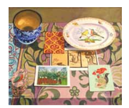
TITLE: Unknown MEDIA: Oil on canvas YEAR: 1996 №: Pc027 LOCATION: Central Hallway