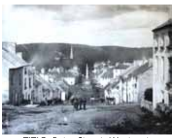
TITLE: Peter Street, Westport MEDIA: Photograph YEAR: 1904 №: PH050 LOCATION: Main Stairwell