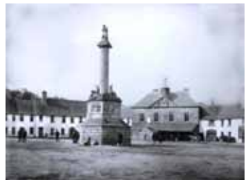
TITLE: Clendenning Monument, the Octagon, Westport MEDIA: Photograph YEAR: 1904 Nº: PH049 LOCATION: Main Stairwell

Most of this collection is made up of people, topographical views and interior views throughout Ireland. Included in the main reading room of the National Library of Ireland.