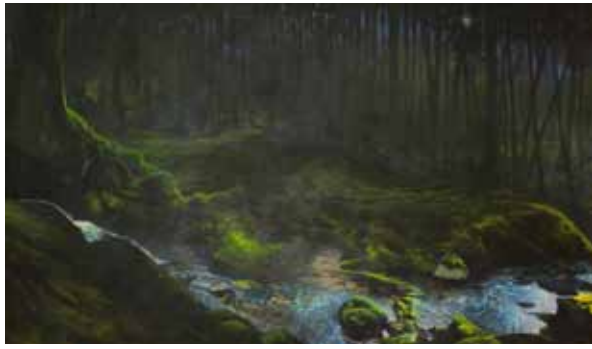
TITLE: River by the Moonlight MEDIA: Oil on canvas YEAR: 1997 Nº: Pc036 LOCATION: Central Hallway