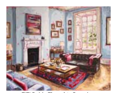
TITLE: My Thoughts Escaping MEDIA: Oil on canvas YEAR: 2015 Nº: Pc023 LOCATION: Park Terrace Wine Bar

Nº: PCUII LOCATION: Park Terrace Wine Bar