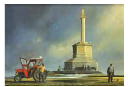
TITLE: Coveys on the Octagon MEDIA: Oil on canvas YEAR: 2006 Nº: Pc058 LOCATION: Cobbler's Bar

His work has been likened to the surrealism. "As warm and fantastic as a good dream".