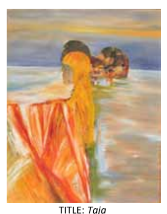
MEDIA: Oil on board YEAR: 1999 Nº: Pp012 LOCATION: Park Terrace Wine Bar