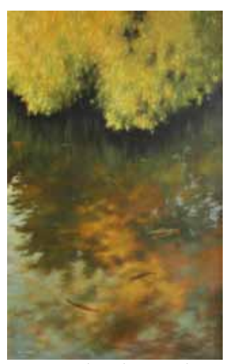
TITLE: The Galway Canal MEDIA: Oil on canvas YEAR: 1986-88 Nº: Pc021 LOCATION: Park Terrace Wine Bar