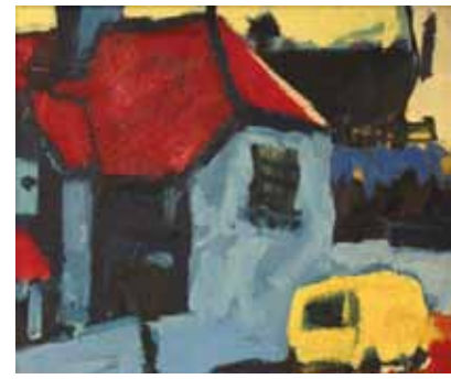
TITLE: Joyces MEDIA: Oil on canvas YEAR: 1998 Nº: Pc072 LOCATION: JW's Brasserie - Bar