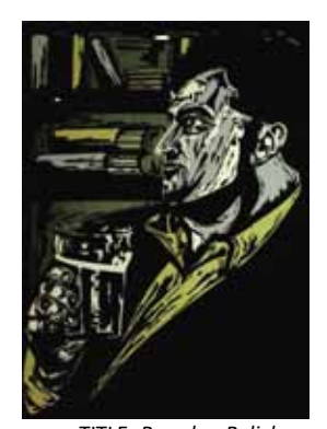
TITLE: Brendan Belich MEDIA: Linocut on Paper YEAR: 1998 Nº: Ep082 LOCATION: JW's Brasserie - Red Room