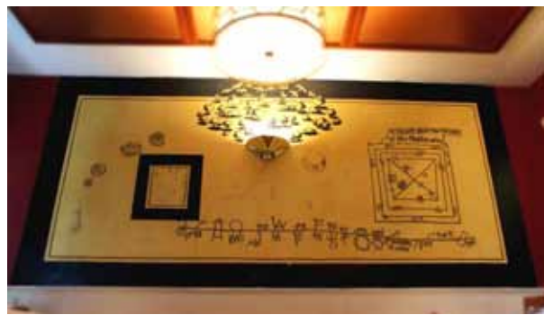
TITLE: Mural 1: Ogam alphabet from the Book of Ballymote and Irish archaeological artefacts MEDIA: Decoupage and Signwriting YEAR: Late 90s №: M106