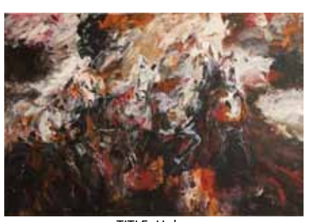
TITLE: Unknown MEDIA: Oil on canvas YEAR: After 2003 №: Pc005