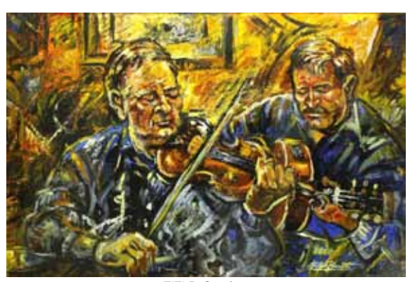
TITLE: Session MEDIA: Oil on Canvas YEAR: Unknown Nº: Pc053 LOCATION: Cobbler's Bar