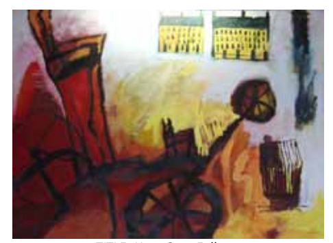
TITLE: Your Own Fellow MEDIA: Oil on canvas YEAR: 1999 №: Pc108