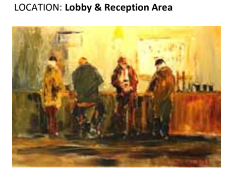
TITLE: A quiet pint MEDIA: Oil on Canvas YEAR: Unknown Nº: Pc081