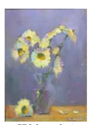
TITLE: Summer Scent MEDIA: Oil on Canvas YEAR: 1994 Nº: Pc014 LOCATION: Park Terrace Wine Bar