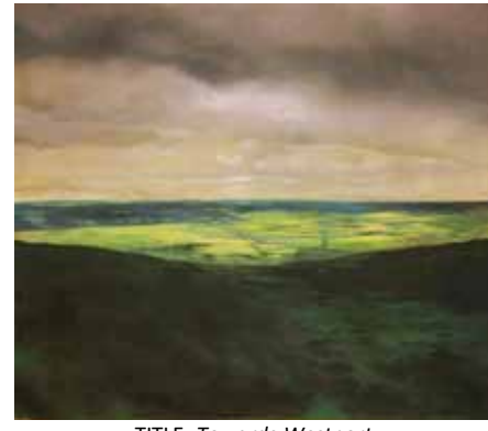
TITLE: Towards Westport MEDIA: Oil on canvas YEAR: 2006 Nº: Pc002 LOCATION: Lobby & Reception Area