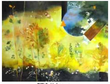
TITLE: Unknown MEDIA: Watercolour on Paper YEAR: Unknown Nº: Pp062 LOCATION: Cobbler's Bar