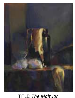
MEDIA: Oil on Canvas YEAR: 1993 №: Pc006 LOCATION: Lobby & Reception Area