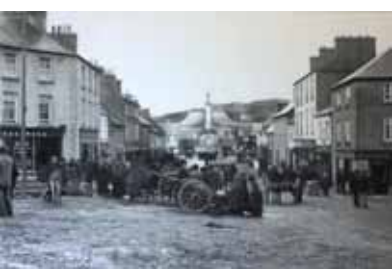
TITLE: Shop Street, Westport MEDIA: Photograph YEAR: 1904 №: PH052 LOCATION: Main Stairwell