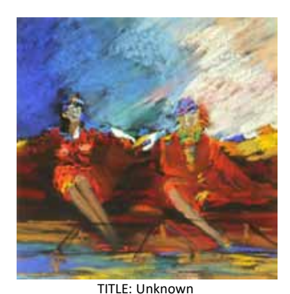
MEDIA: Pastels on Paper YEAR: Unknown Nº: Dp063 LOCATION: JW's Brasserie - Bar