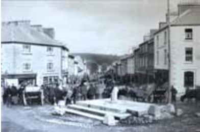
TITLE: Bridge Street, Westport MEDIA: Photograph YEAR: 1904 Nº: PH051 LOCATION: Main Stairwell