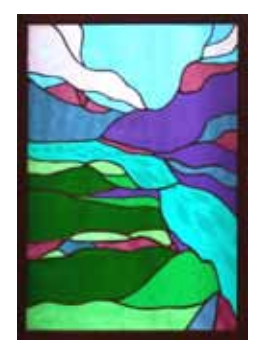
TITLE: Tryptich - The Famine1 MEDIA: Stained Glass YEAR: 1995 Nº: G100