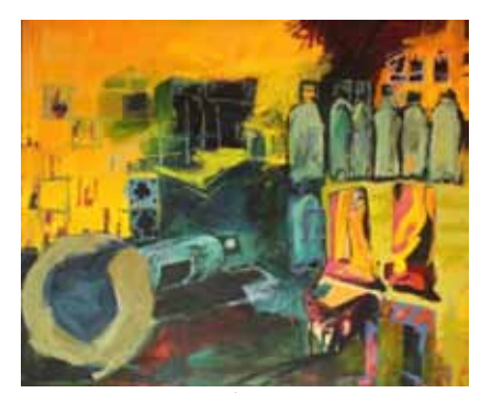
TITLE: The Game MEDIA: Oil on canvas YEAR: 1999 Nº: Pc107 LOCATION: JW's Brasserie - Mezzanine