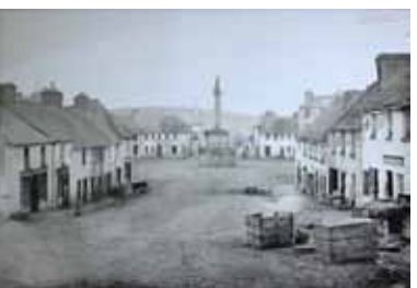
TITLE: Peter Street looking to Clendenning Monument, Westport MEDIA: Photograph YEAR: 1904 Nº: PH008 LOCATION: Lobby & Reception Area