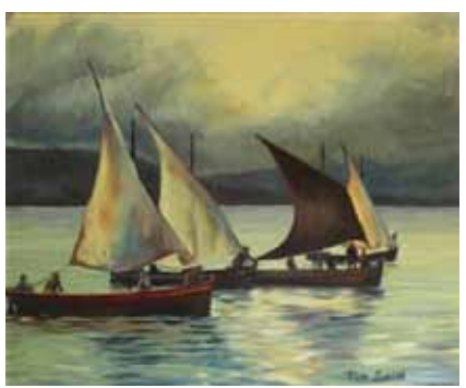
TITLE: Unknown MEDIA: Oil on canvas YEAR: Unknown Nº: Pc032 LOCATION: Central Hallway

Born in Hertfordshire, England in 1947 and at the age of 22 he moved to Westport. Over the years he has been renowned for his portraits, but he concentrates on landscape painting.