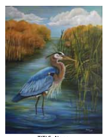
TITLE: None MEDIA: Oil on canvas YEAR: 2016 Nº: Pc035 LOCATION: Central Hallway