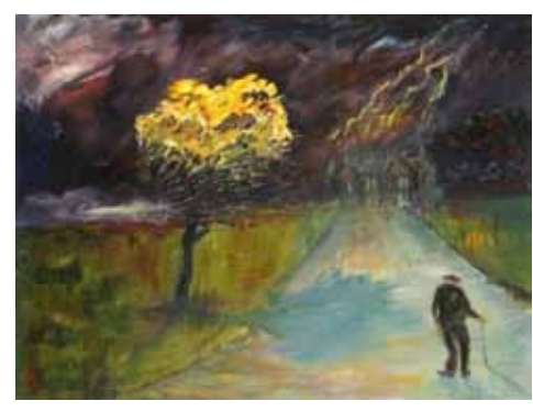
TITLE: Haunted House MEDIA: Oil on Canvas YEAR: Unknown