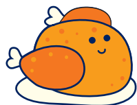
Turkey & Ham