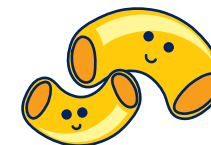
Penne Pasta Marinara