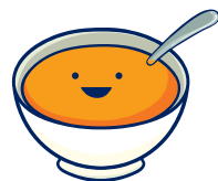
Kids Soup (Ce, Su)